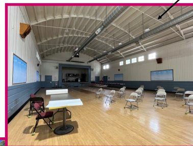
Auditorium on Mesa Street