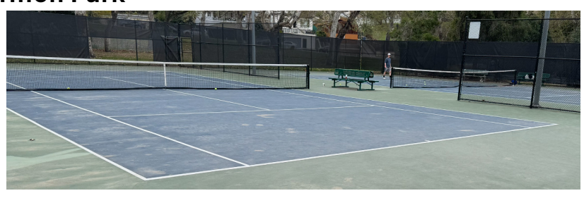
Empty Courts 11:00am