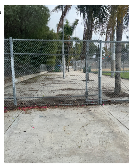
Location of where port-a-potties would be at baseball field