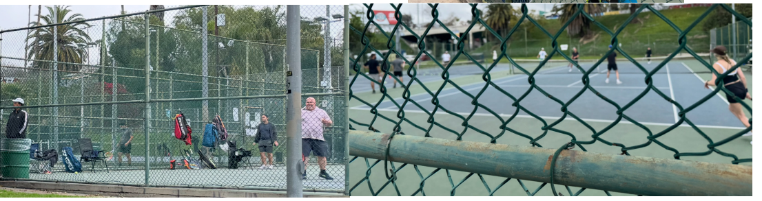
Players waiting 9:00am Liveball 11:30am