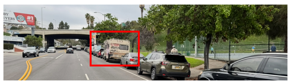
Crowded Glendale Blvd.