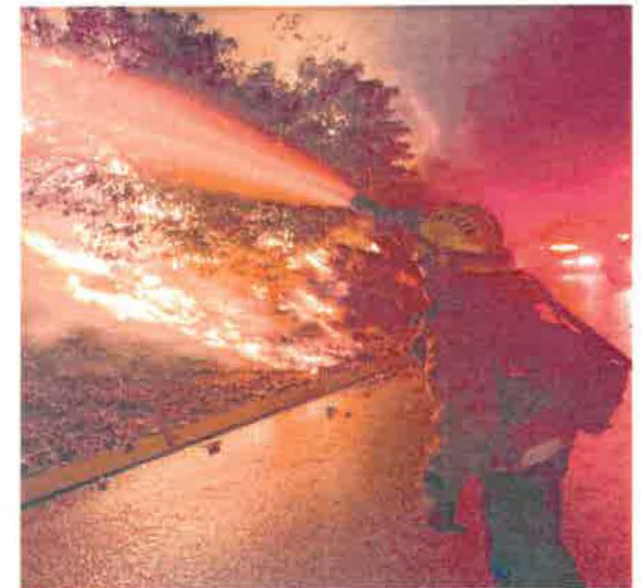
Sunset Fire @ Runyon Canyon Park