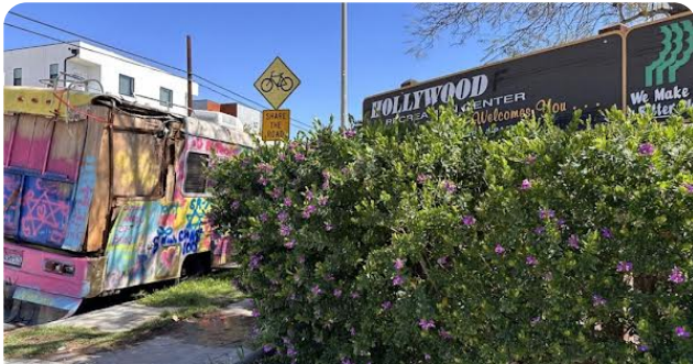
Encampments and Drug Trade Fuel Costly Destruction of Los Angeles Parks westsidecurrent.com